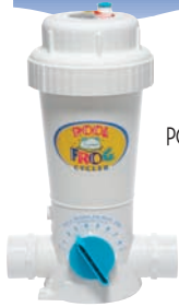
POOL FROG® In Ground System