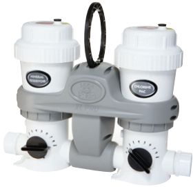
POOL FROG® XL PRO In Ground System with X-tended Pac Life