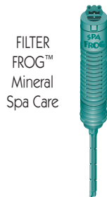
FILTER FROG™ Mineral Spa Care

KING TECHNOLOGY, INC. 952-933-6118 www.kingtechnology.com