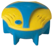
INSTANT FROG® Mineral Sanitizer for In Ground Skimmers