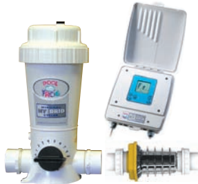
POOL FROG® Mineral Hybrid Combines Benefits of 2 Technologies for Complete Pool Care