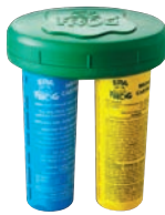
SPA FROG® Floating System Floats in Any Spa