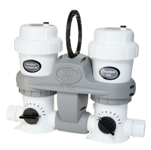
POOL FROG® XL PRO In Ground System with X-tended Pac Life