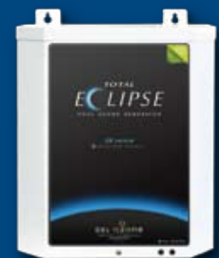
Total Eclipse™ 2 & 4